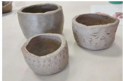
wonderful pinch pots using nature for texture