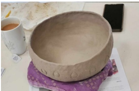
Rebecca's huge pinch pot