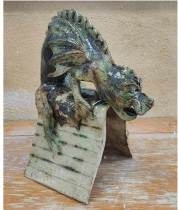
Maragaret's terrific gargoyle