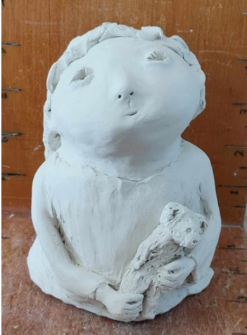
Cat's work in progress character