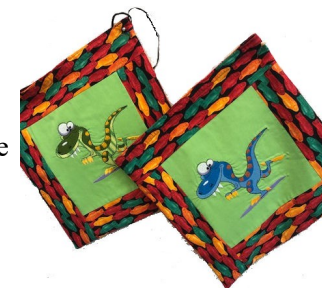
Library bags for the children