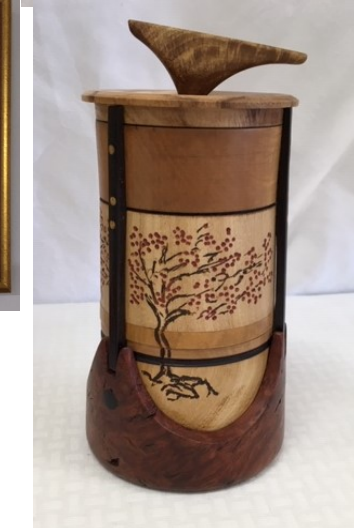
Just a small sample of the beautiful crafts displayed at the Exhibition